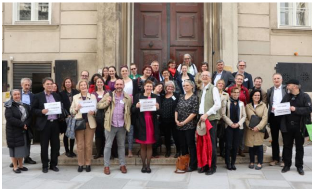
Participants of the international multiplier event

From 11-12 April 2018, Vienna was host to the final Multiplier Event of the READY project. Participants from nine European countries attended and participated in the keynotes on whether and in what form an ethnically, culturally and religiously diverse Europe needs religious education and consider how the RE classroom can do justice to this. The central findings from the project were further developed in a variety of workshops which reflected on issues such as theology and truth claims, RE for everyone in a class, Islamic RE and inter-religiousness in early childhood education. Participants also had the opportunity to go on city walks through the Islamic and Jewish Vienna and learn about the impact of the Reformation on the city as well as experience an 'Evening of Welcome' with Sufi and Klezmer music.