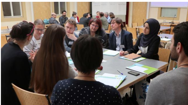
International discussions on diversity in the classroom